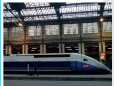
Examples of Complex Systems